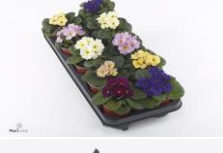
Primula (Acaulis Grp) Obsidian mixed