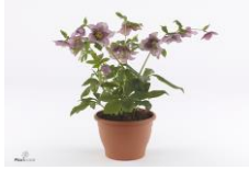
Helleborus x hybridus Viv Celestina