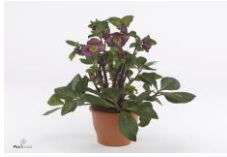
Helleborus x hybridus 'Red Princess'