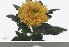
Chrysanthemum (Indicum Grp) disbudded Etrusko Orange