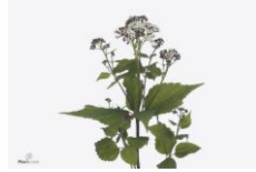
Eupatorium rugosum Lucky Pink