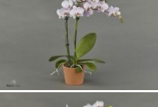
Phalaenopsis Lovable Luz