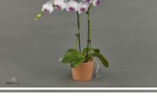
Phalaenopsis Dreamy Vision