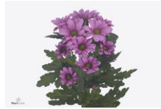
Chrysanthemum (Indicum Grp) spray Tendenza