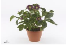
Helleborus x hybridus Viv Batista