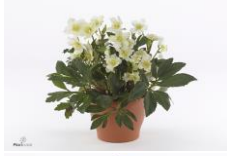
Helleborus niger Viv Viktor