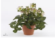
Helleborus x hybridus Pink Princess