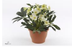
Helleborus niger