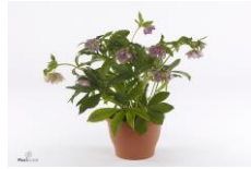
Helleborus x hybridus Viv Alessia