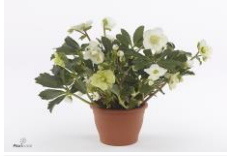
Helleborus 'White Princess'