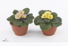
Primula (Acaulis Grp) 'Obsidian Peach'