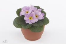
Primula (Acaulis Grp) 'Obsidian Rose Antique'