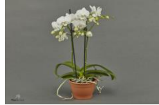
Phalaenopsis Multifloratypes Lexi