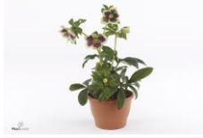
Helleborus x hybridus Viv Serafina