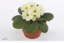
Primula (Acaulis Grp) 'Obsidian Light Yellow'