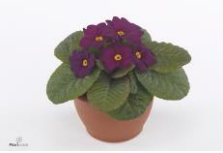
Primula (Acaulis Grp) 'Obsidian Purple'