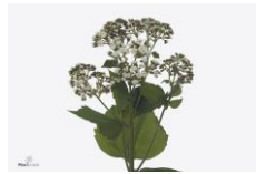
Eupatorium rugosum Lucky Charm