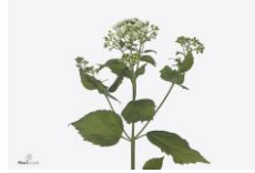
Eupatorium rugosum Lucky Moments