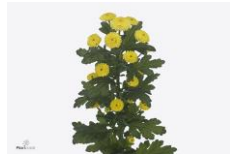
Chrysanthemum (Indicum Grp) spray santini Pizarro Yellow